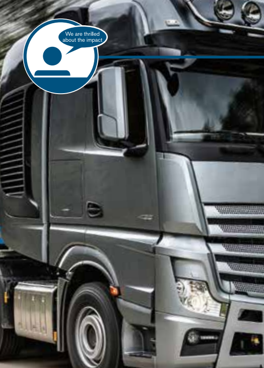
Ultra-high solids (UHS) + water-borne coatings: chassis, cabin, dump body, trailer, plastic parts