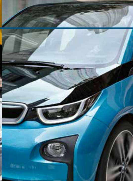
Water-borne coatings: car exterior and interior