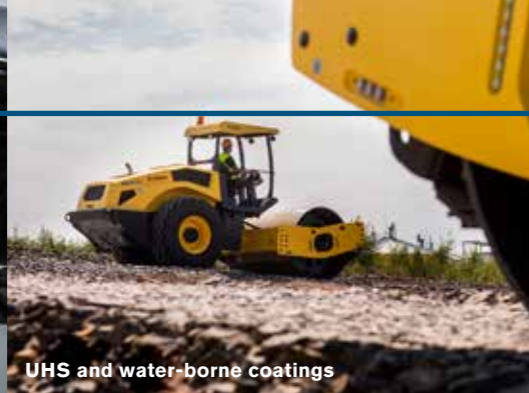
UHS and water-borne coatings