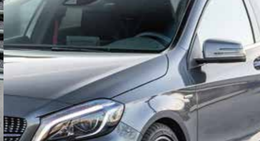
Painted film: roof rails, panels, pillars, trims, grilles